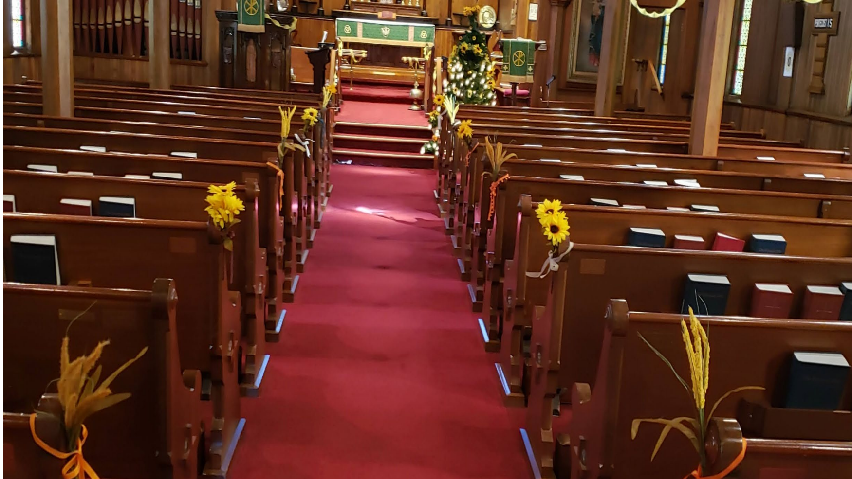
Season of Creation church decorations at Church of the Good Shepherd, Houlton.